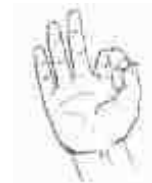
OK? OK with Glove On