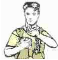
Share Air or Buddy Breath