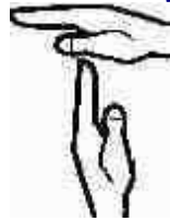
100 Bar in Tank