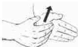
Redo Whole Skill