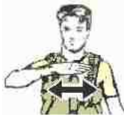
Out Of Air