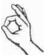
The Standard OK? OK Signal