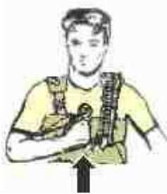
Low On Air