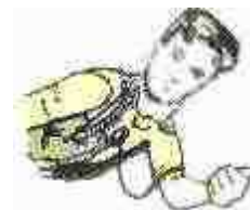
Go That Way