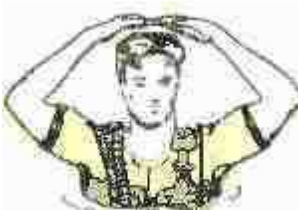
Big OK? OK to Shore or Boat at a distance