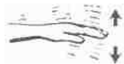
Calm Down / Slow Down