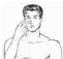
Look / Watch