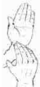
How Much Air Do You Have?