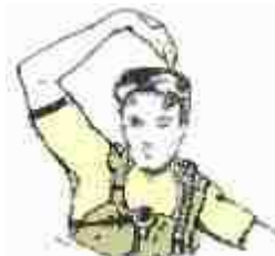
Big OK? OK in Water